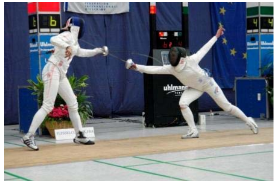
Women's Epee World champion Flessel-Colovic (FRA) touches Stroganova (RUS) in the final of the Luxembourg World Cup event 2007